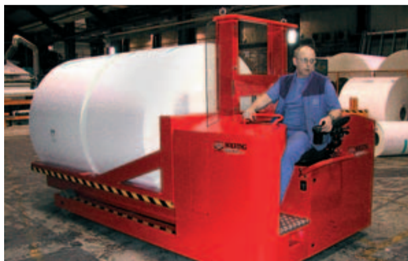
Solving has supplied an electric ride-on truck to Iggesund Paperboard in the UK. Similar trucks have been supplied to Stora Enso and UPM.

Solving has introduced a range of customised stand-on and sit-on electric vehicles for loads of up to 10 tonnes.