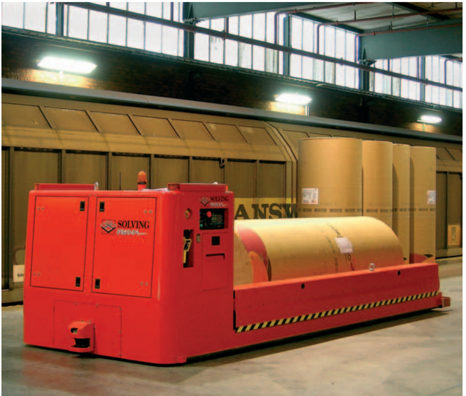
Carrying out monotonous tasks unmanned in an area with a lot of intersecting traffic, the AGV solution turned out to be the best alternative for reel handling at Stora Enso in Kvarnsveden.

Safety is virtually guaranteed by laser and electromechanic bumpers, emergency stop buttons, photo cells, audible signals and warning lights.