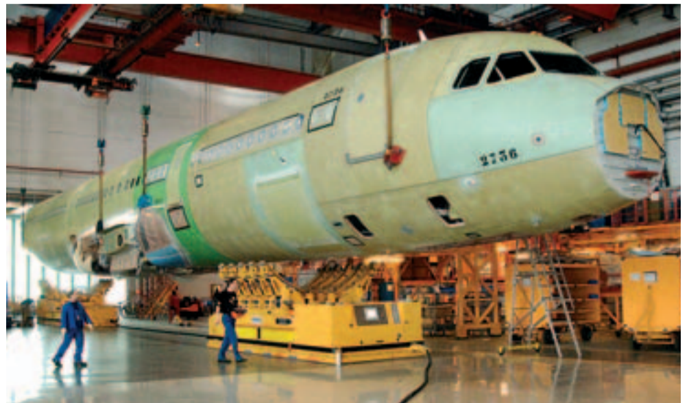
Airbus installed a new tape-guided Solving handling system to achieve shorter production times during the assembly of fuselages and wings for A318, A319 and A321 aircraft.

Equipped with removable pneumatic and electric boxes for easy and rapid removal, the module-built movers are very maintenance-friendly. The maximum down time for maintenance is only two hours.