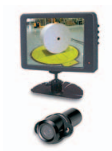
A blind-spot camera enhances safety at Iggesund Paperboard.

Solving's latest range of vehicles provides a rugged construction combining ease of use with ease of maintenance, long shift usage and user-friendly controls. Accessories such as fast charging systems, gel batteries, blind-spot cameras and other features combine to offer customers