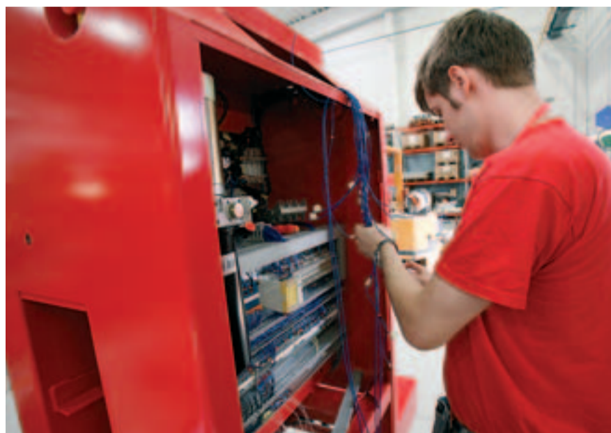
Upgrading older AGV control systems is an alternative to investing in completely new automated guided vehicles and extends the life of existing AGVs by ten years or more.

By upgrading the controls of old Automated Guided Vehicles the life of existing systems can be extended by up to ten years.