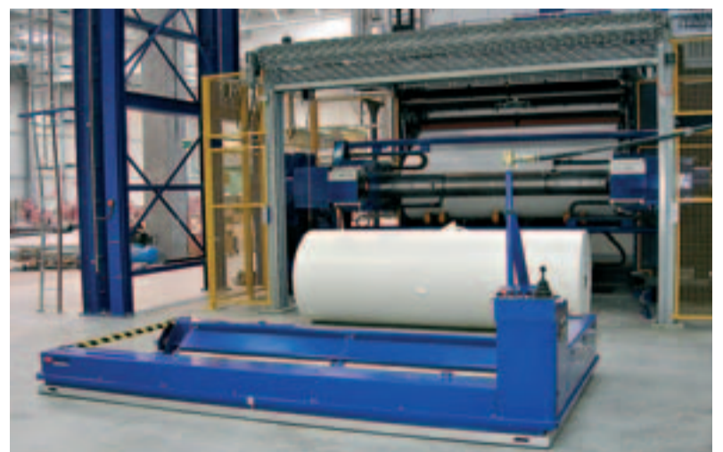
The air film Mover at Bauer Druck's printing house straddles a lifting device for automatically positioning the roll at the correct height for the supporting arms.

At Bauer Druck's printing house in Poland a Solving Air Film Mover collects 10-tonne paper reels directly from the floor and transports them to the roll changer. The paper reel is then driven by the Mover into the reel changer and positioned on top of a lift table mounted in the floor. The lift table is raised between the Mover forks to collect the paper reel and position it in the reel changer.